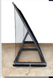
Tow Cable & Galvanized Shackle System

Coastal Portable Litter Control Units are available in a variety of widths and heights with options of netting panels or wire mesh to capture and contain flying litter: