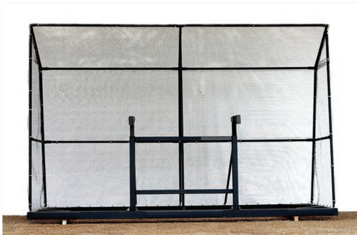
Wire Mesh Litter Control Canopy with Dozer Blade/Bucket Lifting System

Coastal 16-40-8-L – 16' H X 40' L X 8' W